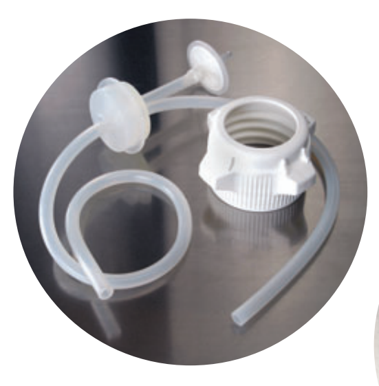
■ Select from 2-port, molded AdvantaFlex cap assemblies (above) or 3-port, hose barb adapter styles (right)